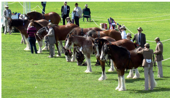
The great turnout for the long reining event