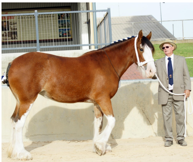
Wheelabarraback Flash Molly