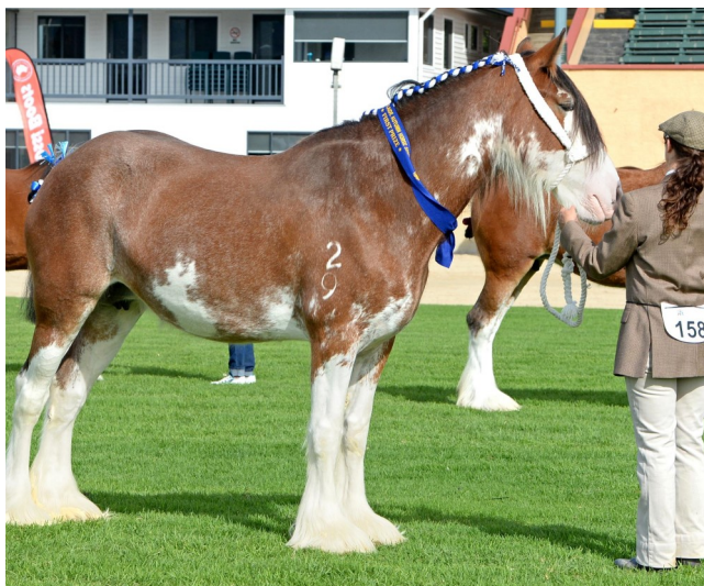
Wheelabarraback Flash Bonnie