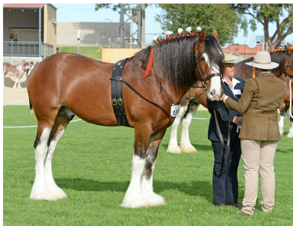
CHAMPION STALLION Highgate Flash Benjamin