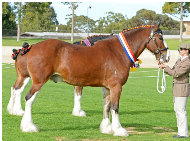
CHAMPION GELDING Glenquarry Scottish Piper