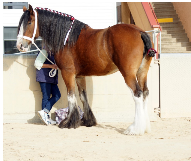
Beereega Lady Carezza