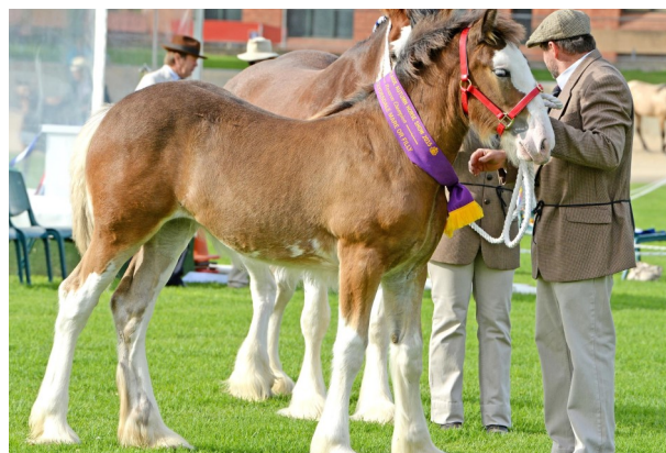
RESERVE CHAMPION MARE/FILLY Glenquarry Myfanwy