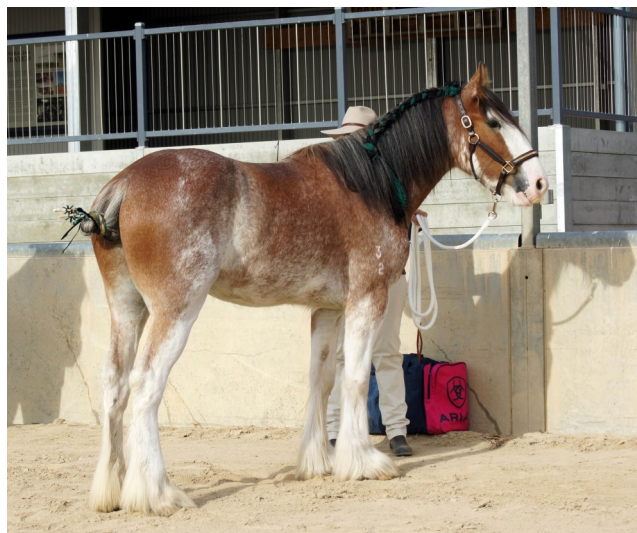
Wheelabarraback Flash Robert