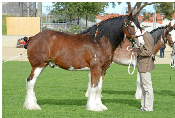
RESERVE CHAMPION GELDING Glenquarry Monty's Boy