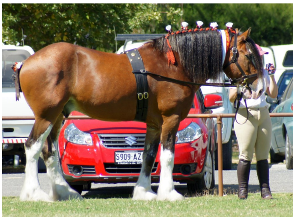
CHAMPION STALLION Highgate Flash Benjamin