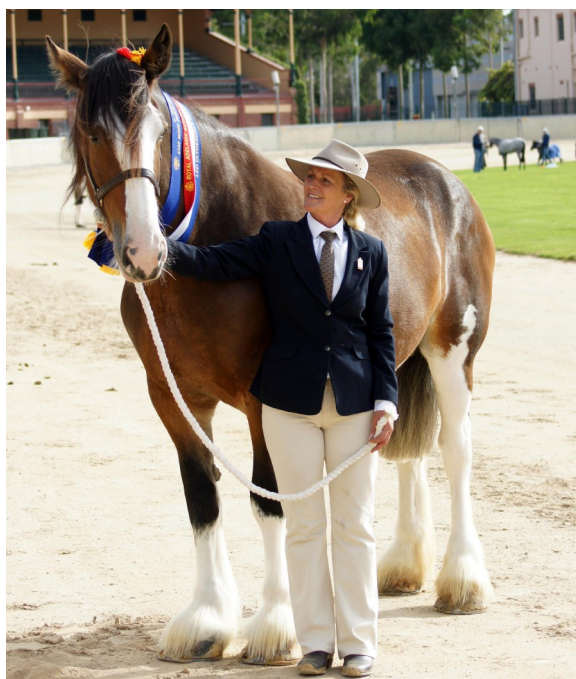
SUPREME CHAMPION CLYDESDALE Lowanvale Merry Owned & shown by L & C Sutherland