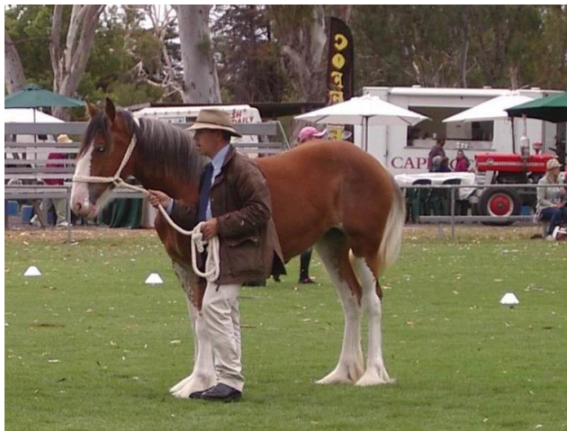
RESERVE CHAMPION LED HEAVY HORSE Carpolac Thomasina D Carracher