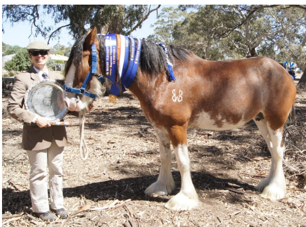
SUPREME CHAMPION CLYDESDALE Wheelabarraback Flash Bonnie