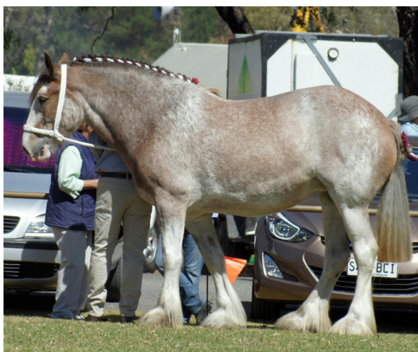
RESERVE CHAMPION MARE Aarunga Delta